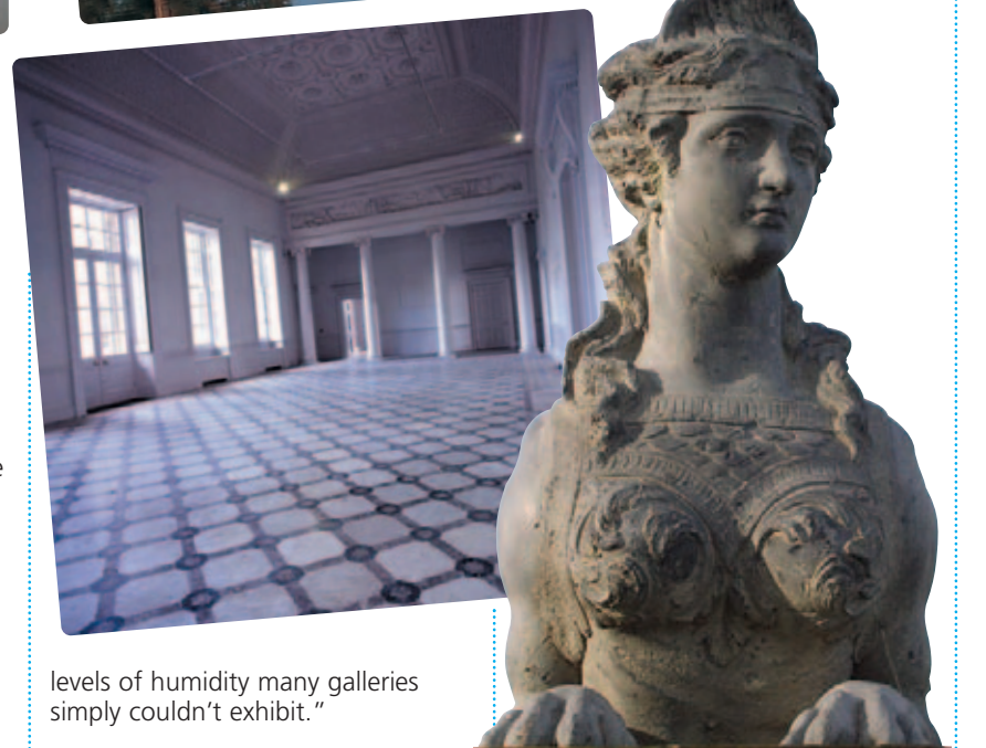
levels of humidity many galleries simply couldn't exhibit."

humidity levels, SGMS' in co-operation with Vapac created a positive air pressure within the galleries and approached humidification issues by oversizing the humidifiers and upgrading some electrode boiler models, controlled by Vapac's own operating system VOS-6.